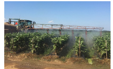
Figure 3. In-season management requires frequent scouting (left) and the timely application of insecticides (right).

2. Timely in-season control of SLWF: Although several insecticides are efficacious against SLWF, most are active on immature stages and provide little or no control of adults. For this reason, it is difficult to rescue a crop once a SLWF population is established. Crops must be monitored closely and control measures implemented early (Figure 3) when established thresholds are met.