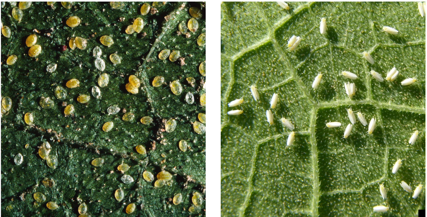
Figure 1. The silverleaf whitefly in immature (left) and adult (right) stages.

The silverleaf whitefly (SLWF), Bemisia tabaci , is an economic pest of numerous crops in Georgia, including cotton and a wide variety of vegetables. Also known as the sweet potato whitefly, immature and adult SLWF (Figure 1) have piercing, sucking mouthparts and damage crops by feeding within vascular tissues and removing plant sap. As they feed, SLWF excrete honeydew, a sticky, sugary solution that accumulates on plants and serves as a food source for sooty mold. Honeydew can cover the plant and block sunlight, resulting in reduced photosynthesis. In cotton, the accumulation of honeydew on lint can have negative impacts on fiber quality and spinning efficiency at mills. In some vegetable crops, SLWF is a vector of viral diseases that can decimate fields, particularly in the fall.