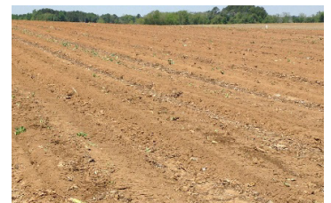
Figure 4. Thorough and timely destruction of host crops after harvest prevents population increases and movement of SLWF to subsequent cropping systems.

3. Complete destruction of host crops after harvest: Crops that maintain green foliage after final harvest can allow for rapid population increases of SLWF. These crops should be rendered as nonhosts as soon as possible after harvest, either through mechanical or chemical termination (Figure 4). Even after chemical burndown of infested crops, large nymphs (third and fourth instars) are likely to complete development. It is preferable to disk the crop immediately after final harvest.