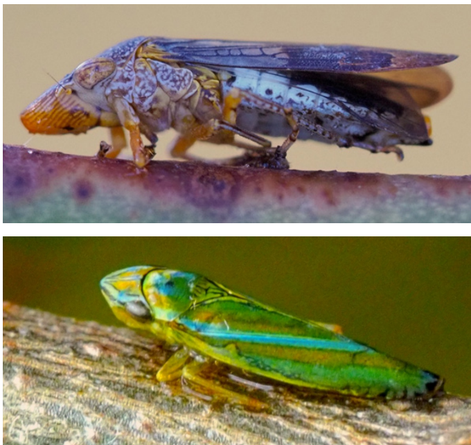
FIGURE 4. Glassy-winged sharpshooter (top) and versute sharpshooter (bottom).

breeding and feeding habitat, but several other problems related to the maintenance of soil structure and erosion prevention arise if the vineyard floor is barren of grasses. An indirect way of managing Xf -positive vectors would be to limit the number of Xf -harboring plants near vineyards. The difficulty lies in determining the plants that are worth managing as (1) many plants that harbor Xf are asymptomatic; (2) Xf multiplies and spreads to different extents across species and results in some plants being “better” inoculum sources than others; and (3) insect vectors may not feed on all Xf -positive plants (Varela et al. , 2001). Application of insecticides, particularly systemic insecticides, from the time of vector detection in the spring is advised (Krewer et al. , 2002). Glassy-winged sharpshooters often feed on the base rather than on the tips of canes, as well as on 2-year-old wood. Thus, early-season through mid-season management is particularly important, since early infections are more likely to lead to movement of bacteria to the cordon and trunk, where bacteria will not be removed through pruning practices (Feil et al. , 2003). UGA Extension Circular 1151 (Hickey et al. , 2018), “Viticulture Management,” is a poster offering a visual reminder and reference for sharpshooter scouting and management throughout the seasonal grapevine growth stages.