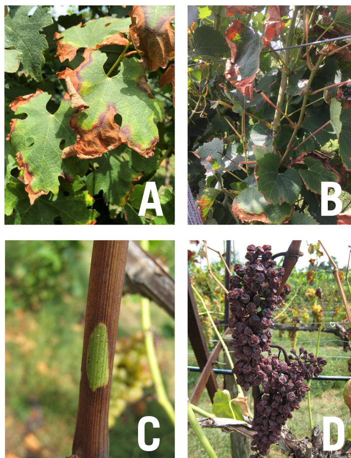
FIGURE 1. Pierce's disease symptoms include marginal leaf necrosis (A), leaf blade abscission from the attached petiole causing “match sticks” (B), “islands” of green tissue on primary grapevine shoots that are normally lignified and brown at this stage (C), and “raisins” (D).

earlier in drought years, but symptoms are generally most evident from late August through September. In grapevines, Xf causes four visual symptoms that together are strongly associated with PD. Leaf necrosis is observed on the margins of leaves (Figure 1A). Marginal leaf necrosis can be a common response to several vineyard issues; its presence alone should therefore not alarm growers. However, growers are encouraged to contact local Extension agents if the following symptoms are observed in tandem with marginal leaf necrosis. “Matchstick” is the term used to describe the symptom that occurs when only the leaf blade abscises and the petiole (leaf stem) remains attached to the shoot (Figure 1B). “Islands of green” describes the phenomenon observed when the shoot tissues harden off unevenly, resulting in green, vegetative “islands” within the brown, woody tissue (Figure 1C). As xylem flow is increasingly blocked by bacteria, infected plants will also form “raisins” as the fruit clusters dry out from lack of translocated water (Figure 1D).