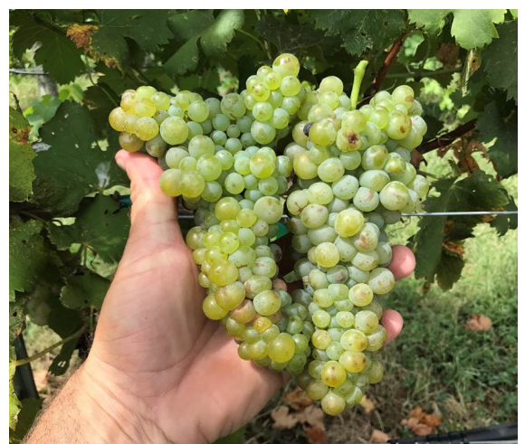
Tight Clusters are Prone to Rots