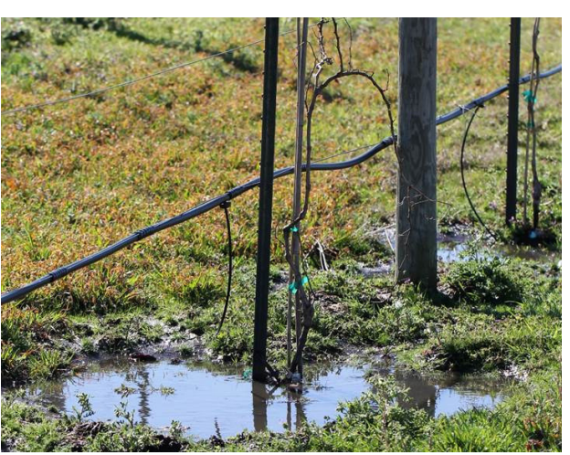
Poor Internal Drainage