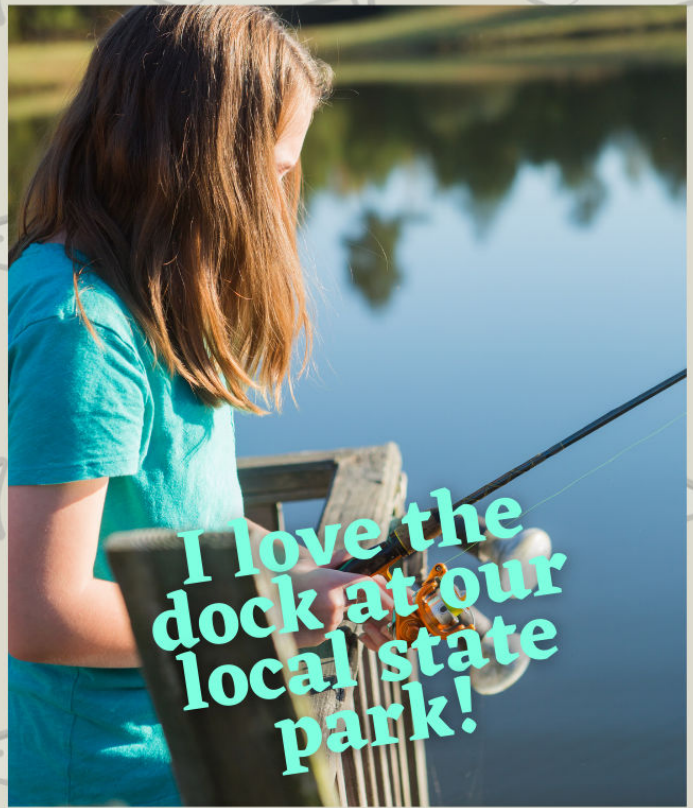
I love the dock at our local state park!