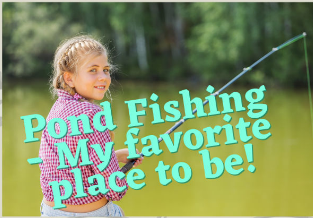
Pond Fishing - My favorite place to be!