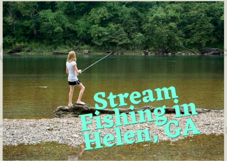
Stream Fishing in Helen, GA