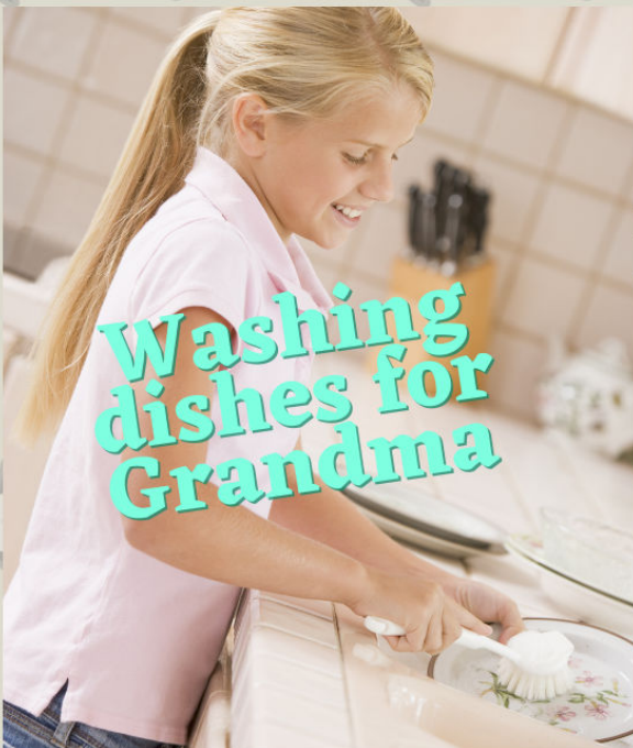
Washing dishes for Grandma