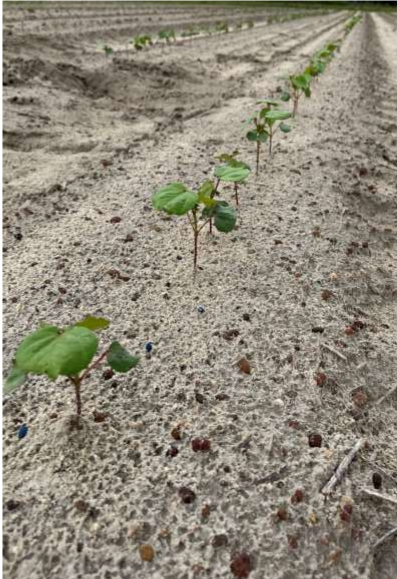
Figure 1. Early-season cotton stand.