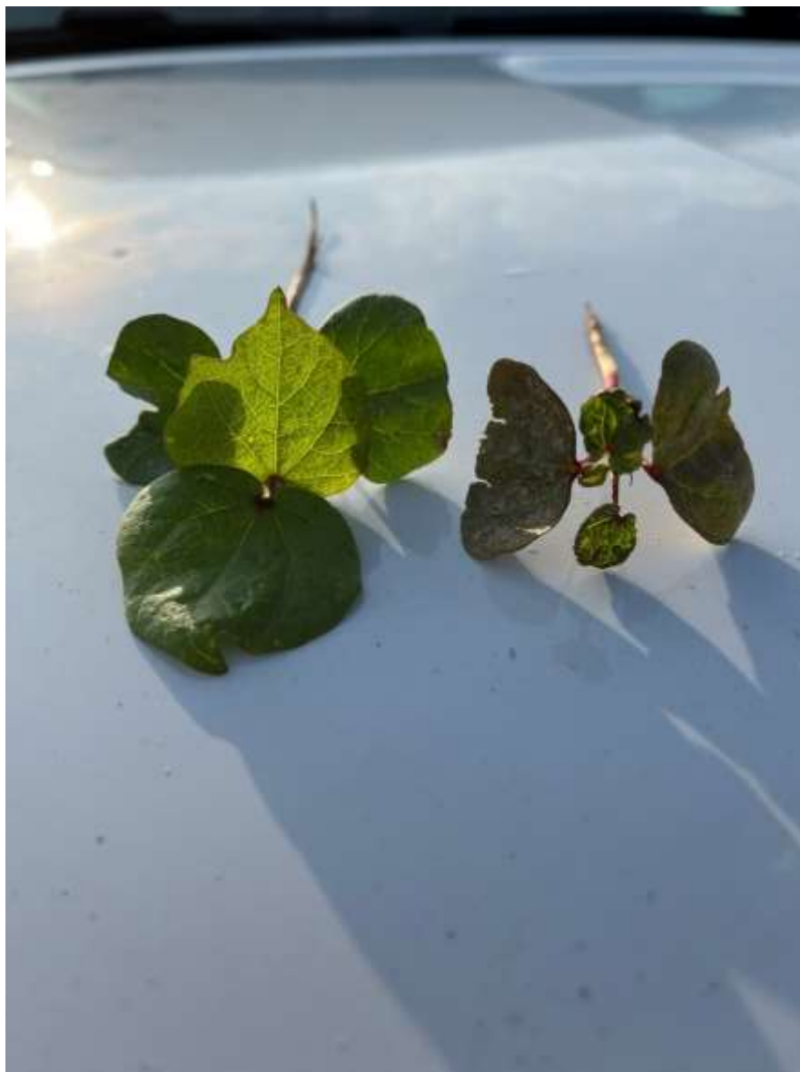
Figure 3. 2-leaf cotton with thrips management tools (left) and no thrips management tools (right).