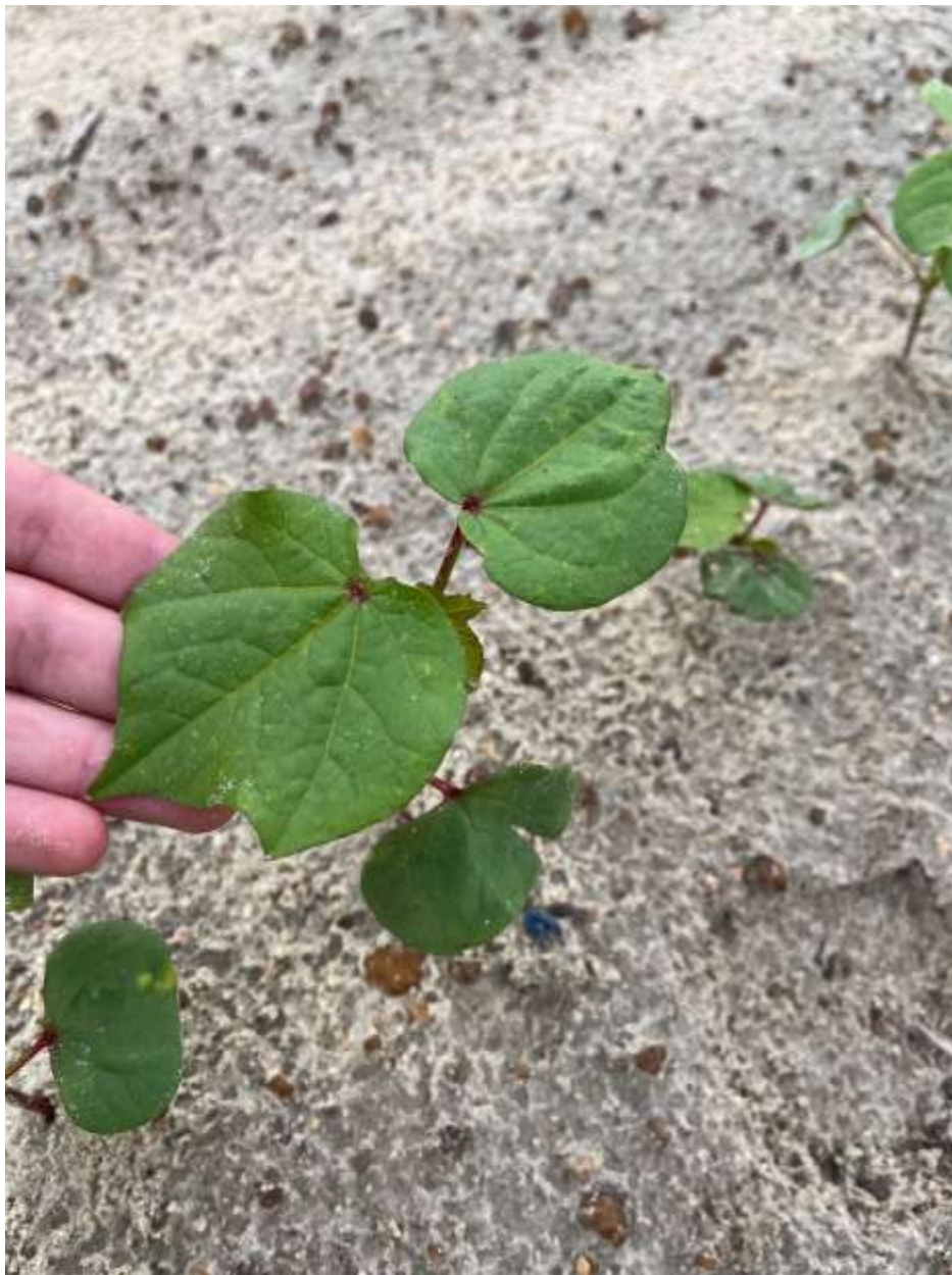
Figure 2. Early season leaf area development.

after planting. Factors such as temperature, water availability, fertility, and pest pressure can influence the rate of canopy closure. Delays in canopy development can also lead to delays in crop maturity. Delayed crop maturity could result in the growing season getting cut short due to cooler weather, depending on region and planting date.