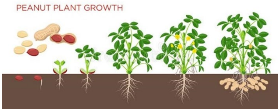
Figure 2. Visual development of root development as the peanut plant progresses in age.

For peanut farmers who utilize tools such as soil moisture sensors for irrigation scheduling, there are a few quick reminders to keep in mind. We tend to visualize the above ground plant biomass and forget what is growing below the surface. We can sometimes be guilty of placing a sensor in the row of the peanuts let it start logging data, making decisions from that data and assuming everything is good to go. Unfortunately, we need to make sure we know what is going on in the field before we blindly start following the sensor. Based on when you planted certain fields peanuts may be spread in age by several weeks while some are still in the bag, this is a good time to think about “weighting sensor depths” according to rooting depths.