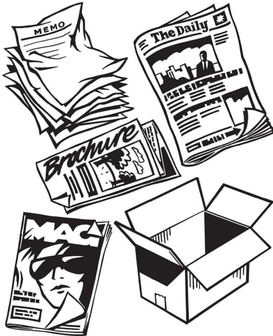
— (B) FIBRES — (paper and cardboard.)

You will see a significant reduction in the amount of TRASH that comes from your home and goes into the landfill if you recycle these things.