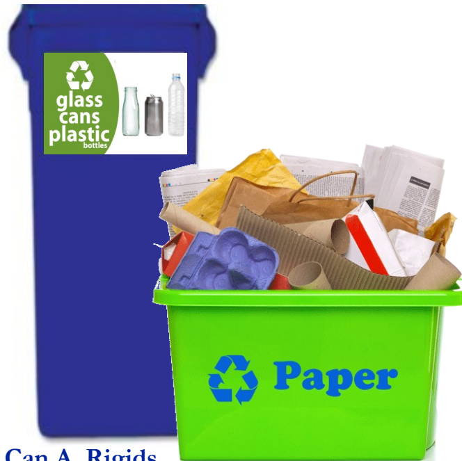
Can A Rigids