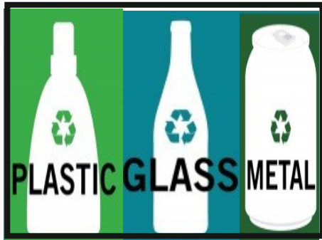
— (A) RIGIDS —