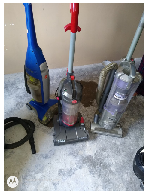
Upright Vacuum Cleaners