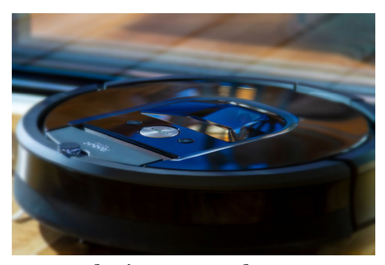
Robotic Vacuum Cleaner