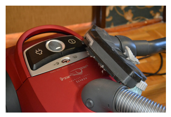
Canister Vacuum Cleaner