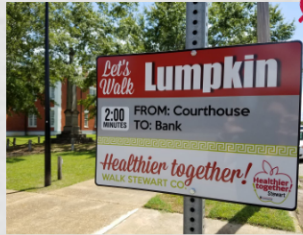
Lumpkin Walkability signage.