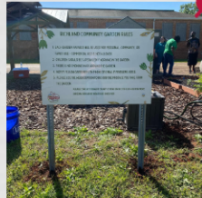
Richland Community Garden sign.