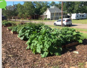
Richland Community Garden harvest.