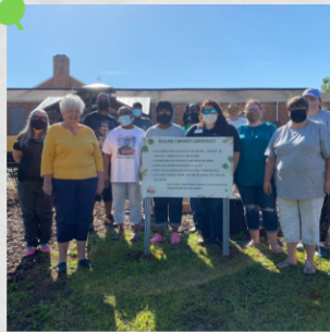
Richland Community Garden work day.