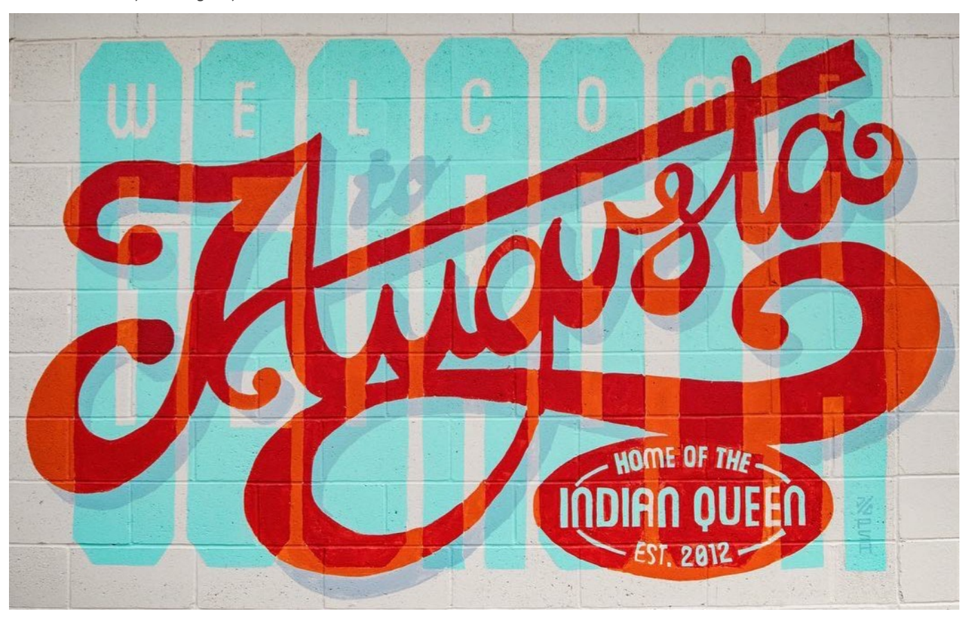
WELCOME TO AUGUSTA Indian Queen bar 2502 Wrightsboro Road, Augusta, GA 30904