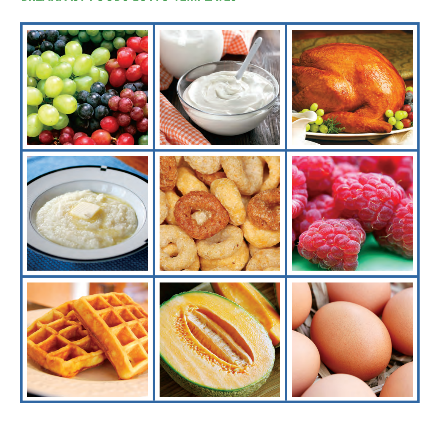
Day 8: Eat Breakfast