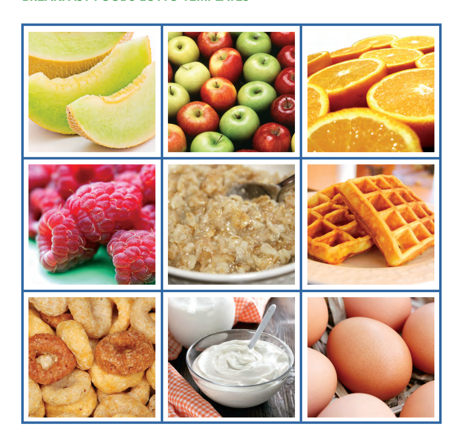
Day 8: Eat Breakfast