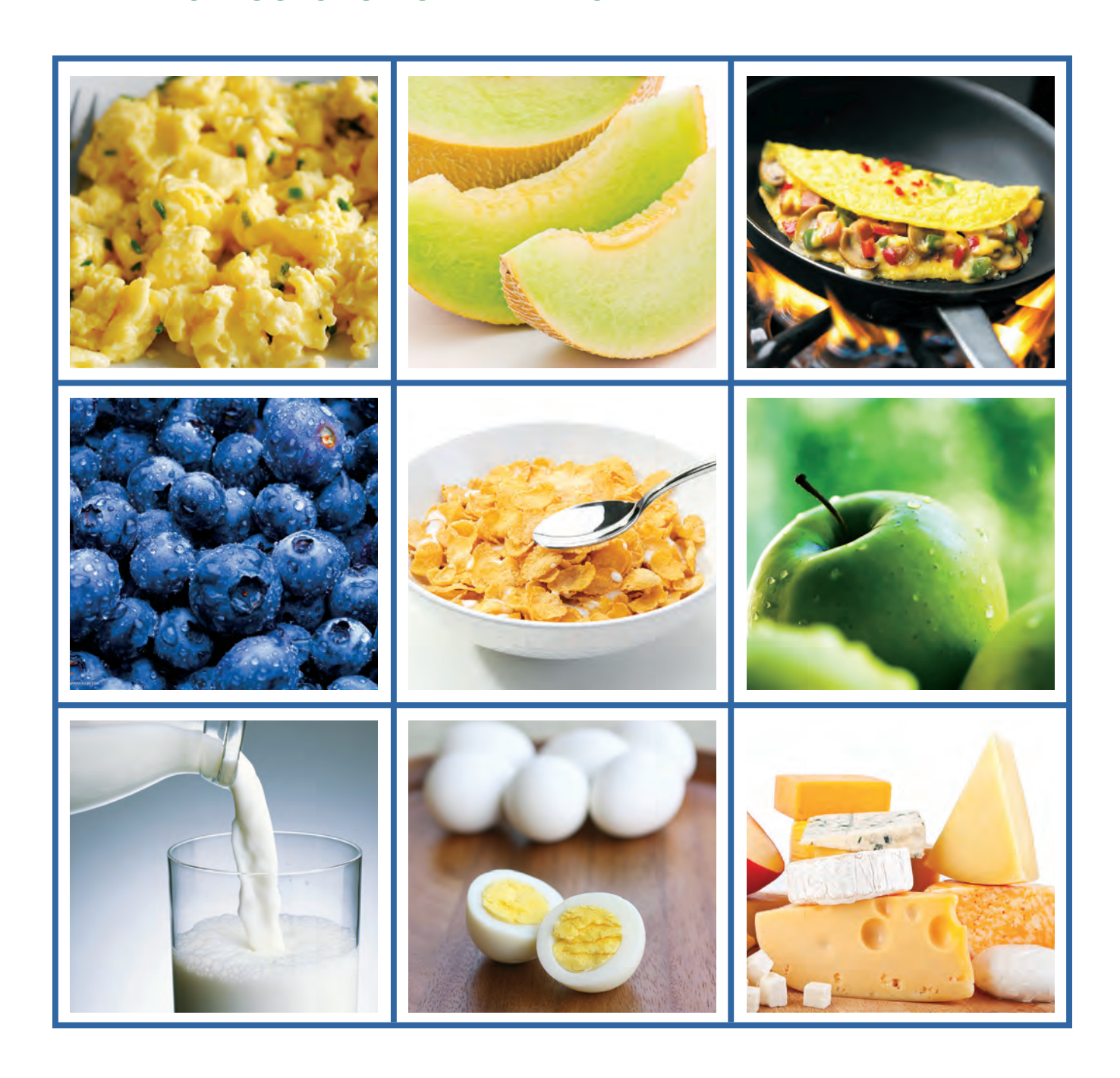
Day 8: Eat Breakfast