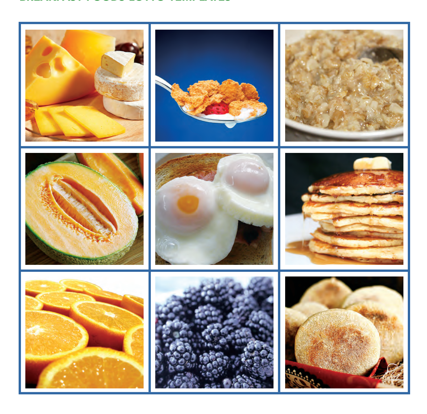
Day 8: Eat Breakfast