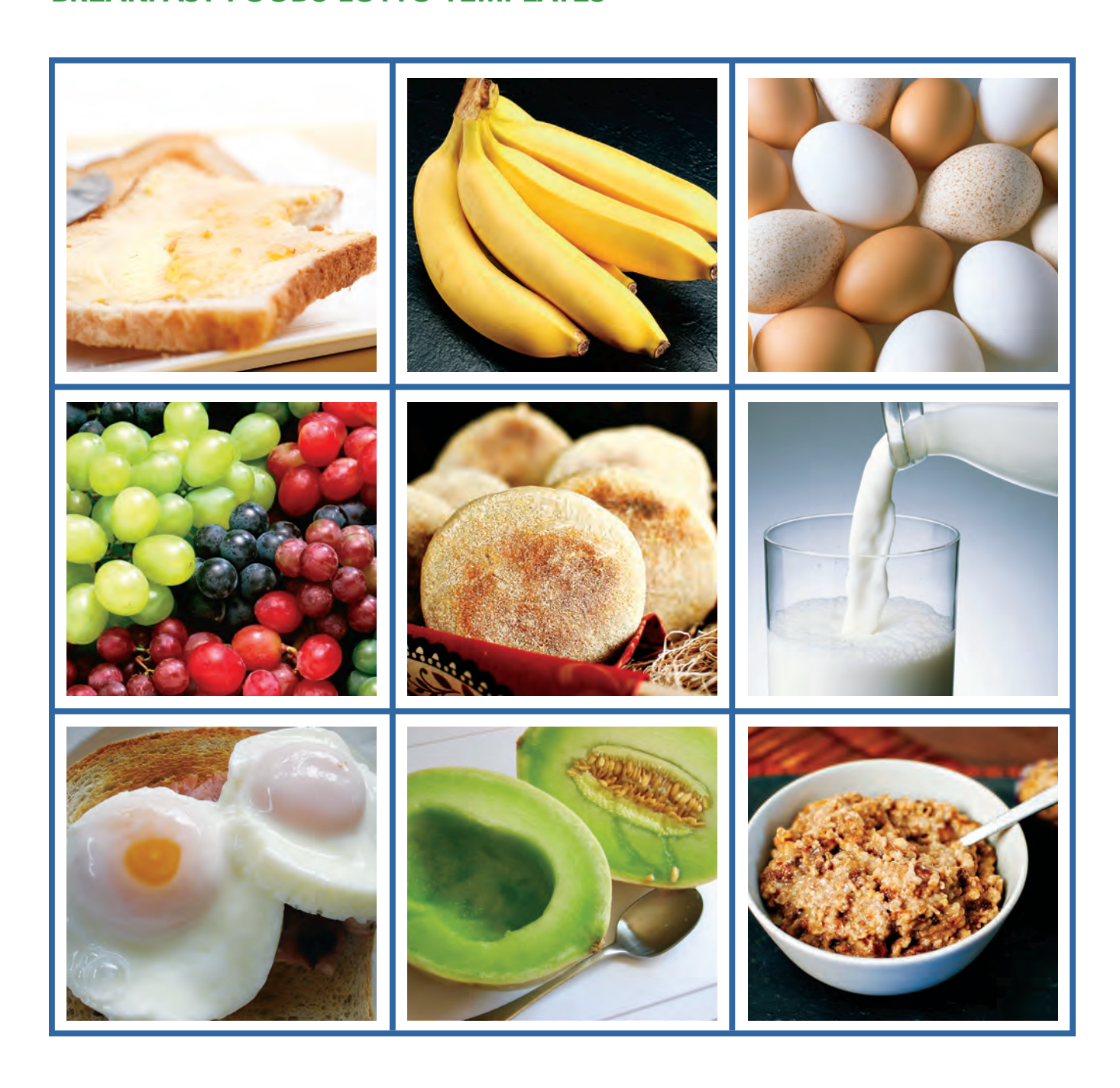
Day 8: Eat Breakfast