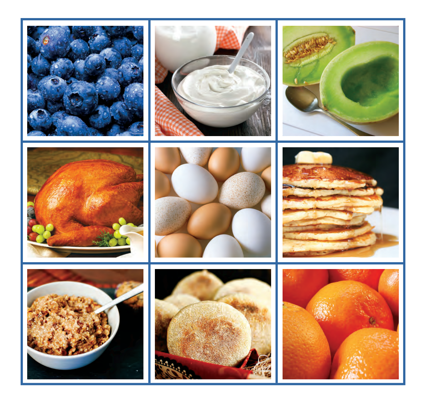
Day 8: Eat Breakfast