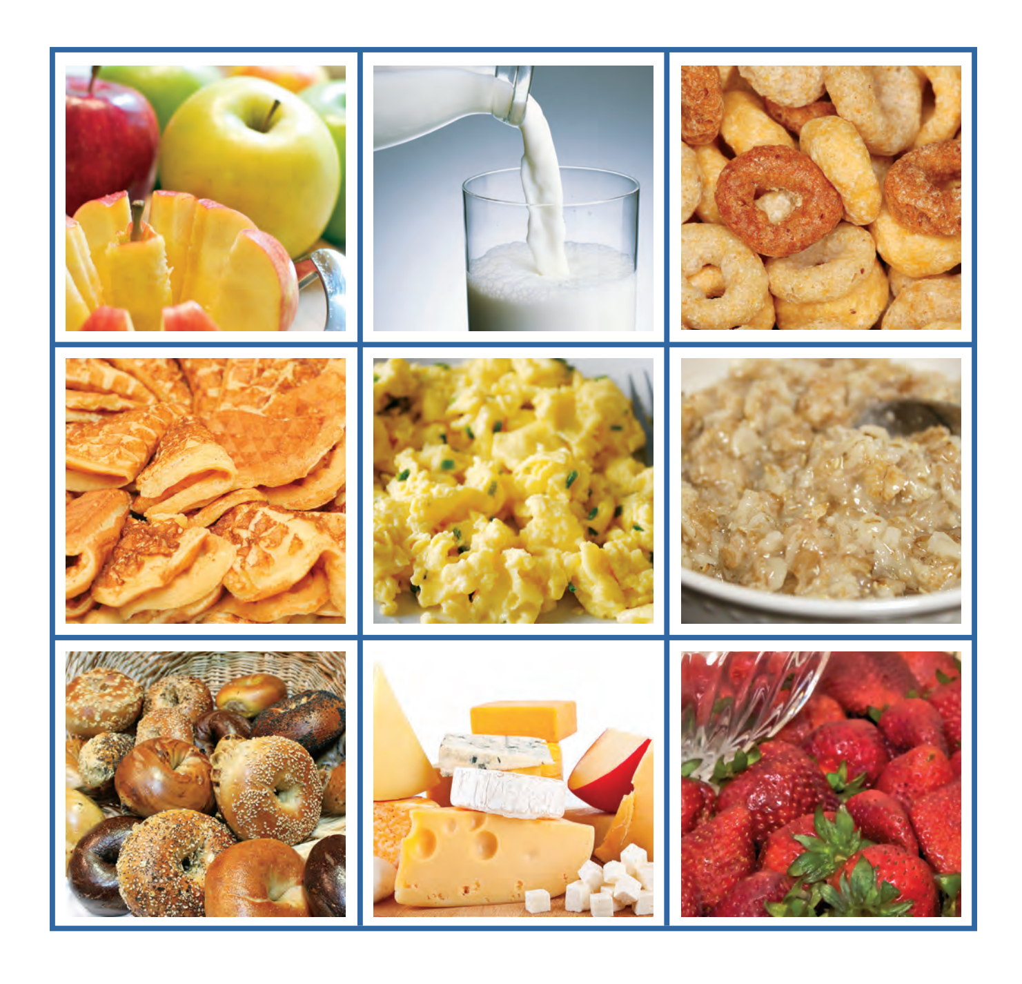
Day 8: Eat Breakfast