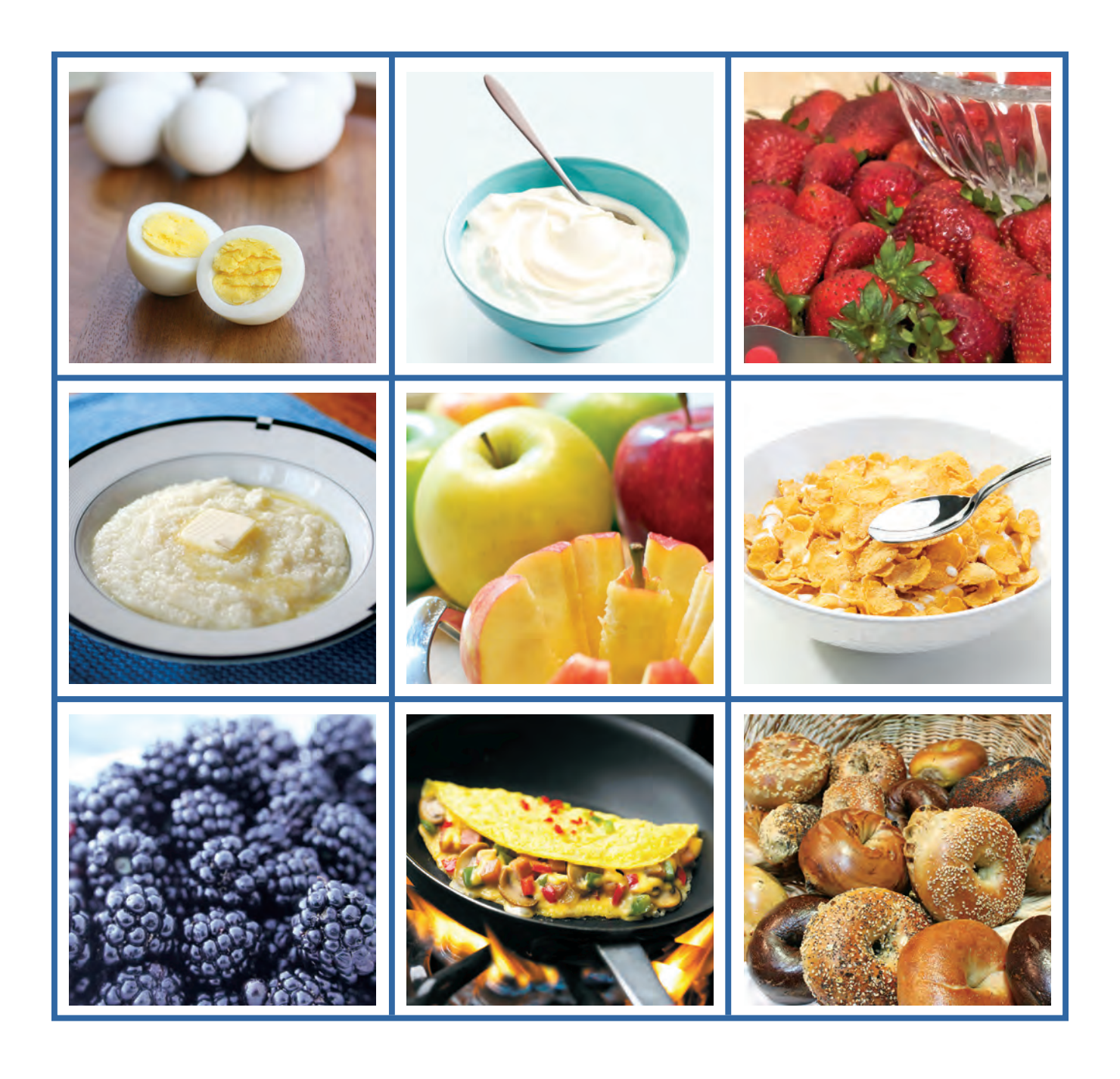
Day 8: Eat Breakfast