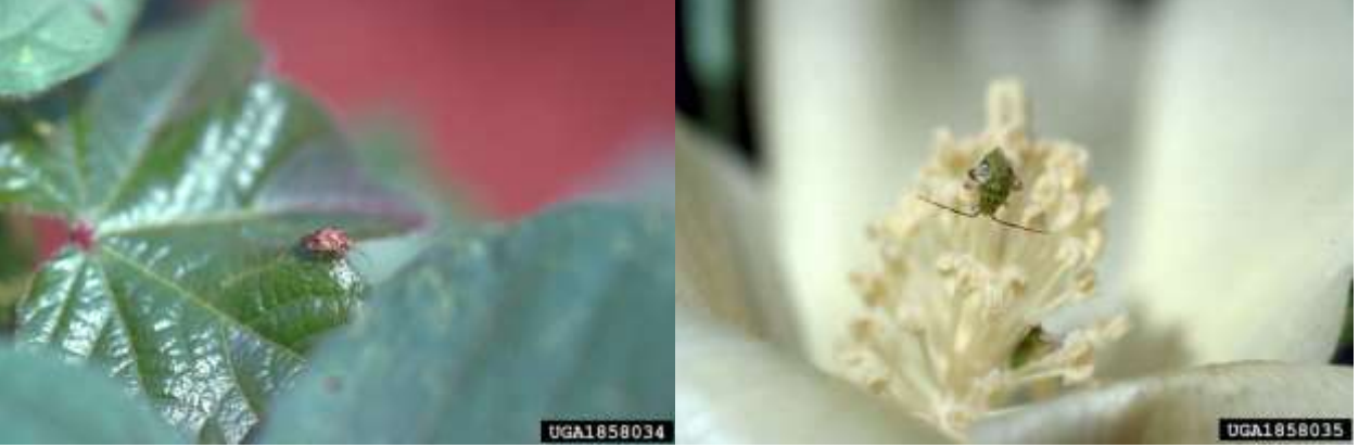
Tarnished plant bug adult (left) and nymph (right).

Adult tarnished plant bugs are about ¼ inch long with a general brown color mottled by patches of white, yellow, reddish-brown or black. A light-colored "V" on the scutellum (behind the head) and two light-colored patches further back on the wings are characteristic. Eggs are about 1 mm long and are almost always embedded into plant tissue, and thus not easily found. Immature tarnished plant bugs typically vary from yellowish-green to dark green or brownish. Early instars can look like an aphid, but tarnished plant bug nymphs run quickly whereas aphids are docile and move very slowly. Later nymphal instars have four dark-colored spots on their thorax and one spot in the middle of the abdomen. Plant bugs have a large host range and survive the winter as adults on wild host plants. Females lay 50-150 eggs which hatch in 7-12 days and nymphs develop into adults in 15-25 days.