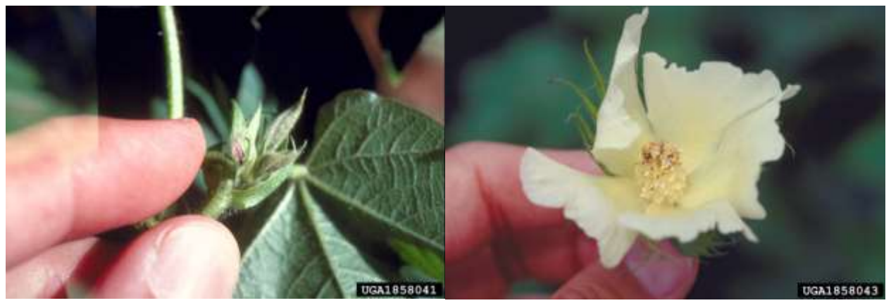
Square shedding due to tarnished plant bug feeding (left) and a dirty bloom resulting from tarnished plant bug feeding on a large square.

Plant bugs have needle-like mouthparts and prefer to feed on small squares. Small squares that have been fed upon will be shed by the plant. Plant bugs may also feed on larger squares and small bolls. Larger squares which have been fed upon may remain on the plant, and will result in "dirty blooms" or blooms that have discolored anthers and/or misshapen petals. Boll feeding by plant bugs appears very similar to damage from stink bugs feeding on bolls.