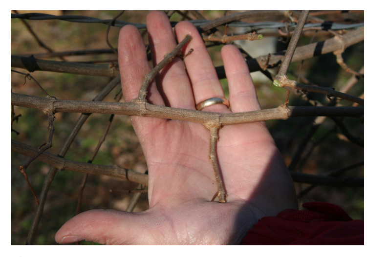
Figure 3. When pruning, try to leave the spurs located along the top of the arms.

Third year —If the vine has grown well the first 2 years and you expect a crop, apply 2 lb of 10-10-10 or equivalent per vine in March. Apply 1 lb of 10-10-10 per vine in May. Broadcast in a 6-ft circle. If