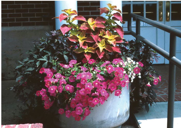
Figure 7. Containers let you put splashes of color where you want it, regardless of soil type, and offer an alternative to flowerbeds. For best results, use quality potting soil and a well-drained container.