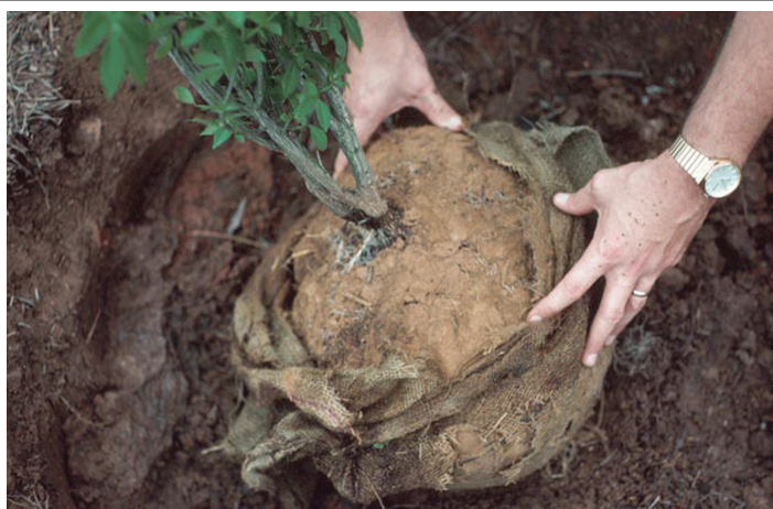
Figure 4. This balled-and-burlapped plant, with the cord cut from around the trunk and the burlap pulled back, is ready for planting.