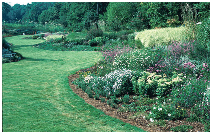
Figure 1. Ornamentals can be grown on poorly-drained soils if they are planted on raised beds.