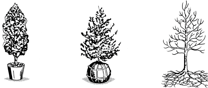
Figure 2. Woody ornamentals for the landscape are commonly sold three ways: container-grown (left), balled-and-burlapped (center) and bare-rooted (right).