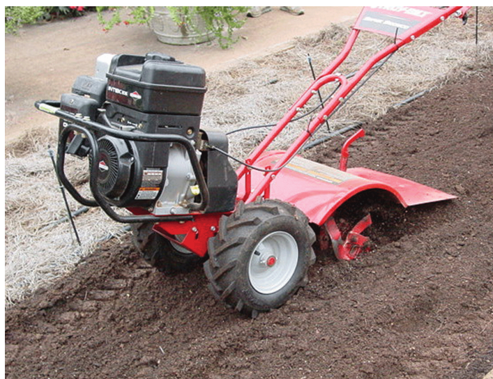
Figure 5. When planting a group of ornamental plants in the landscape, prepare a good bed by deep tilling to a depth of 12 to 15 inches.