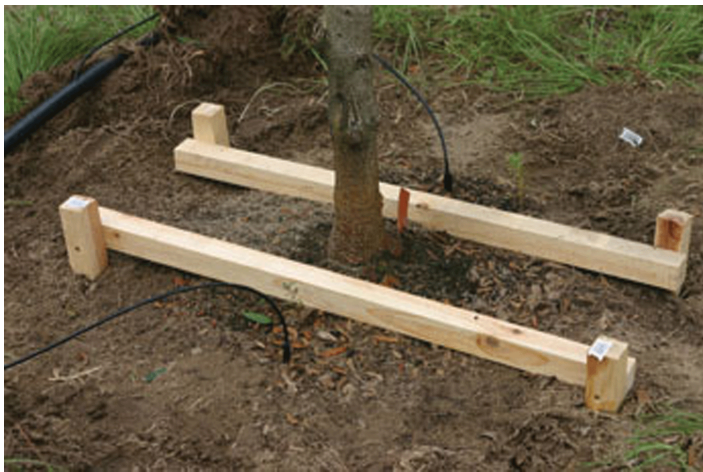
Figure 9. A root ball staking system is an alternative to guy wires.