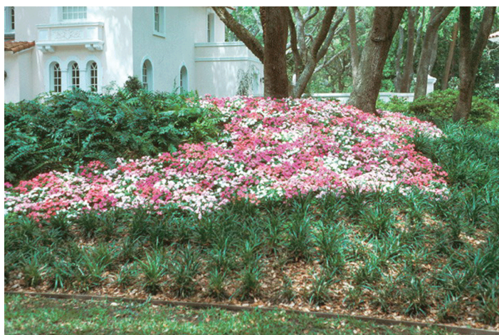
Figure 6. Plant annuals and perennials on raised beds to ensure good drainage and improved visibility.