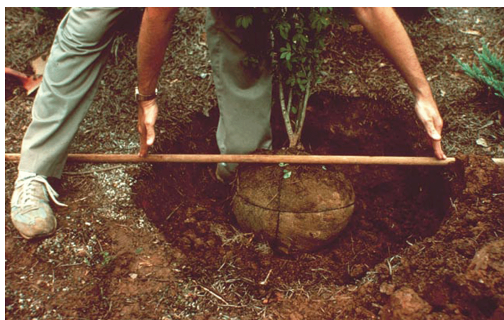
Figure 3. Dig the planting hole two times wider than the root ball. Make certain the top of the root ball is level with the soil surface.