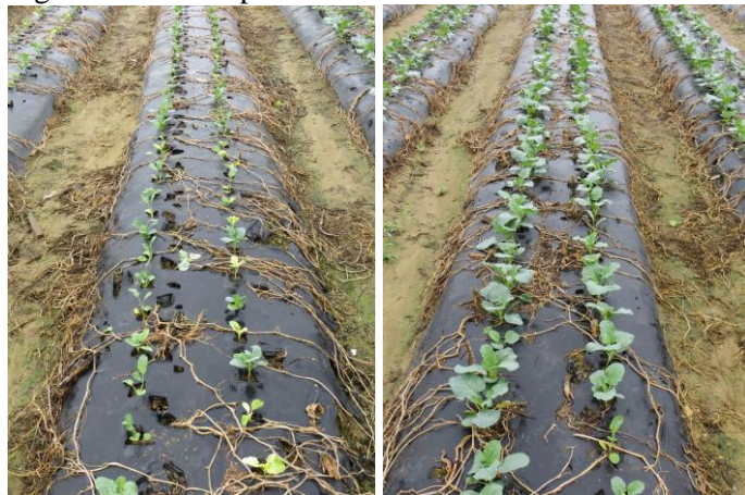
Roundup on mulch