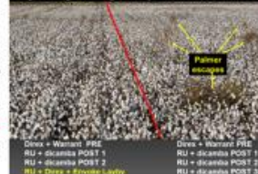
Fig 2. Large Acreage Study – Results At Year 3!

IMPORTANT: Complaints about morningglory, spiderwort, and grass escapes in cotton have risen drastically. This result is primarily a response to making the last herbicide application otop of the cotton where the spray covers the crop but does not effectively contact emerged weeds or the soil for residual control. Layby applications will improve spray coverage of emerged weeds and the soil resulting in better control (Fig 2). diuron + MSMA (best for pigweed) or Roundup + diuron (best for grasses, 2 nd best on pigweeds) are effective options. Add Envoye to improve morningglory control. For spiderwort, add Dual Mag, Outlook, or Warrant. Valor, Caparol, and Cotoran are also useful tools to be considered in a directed system.