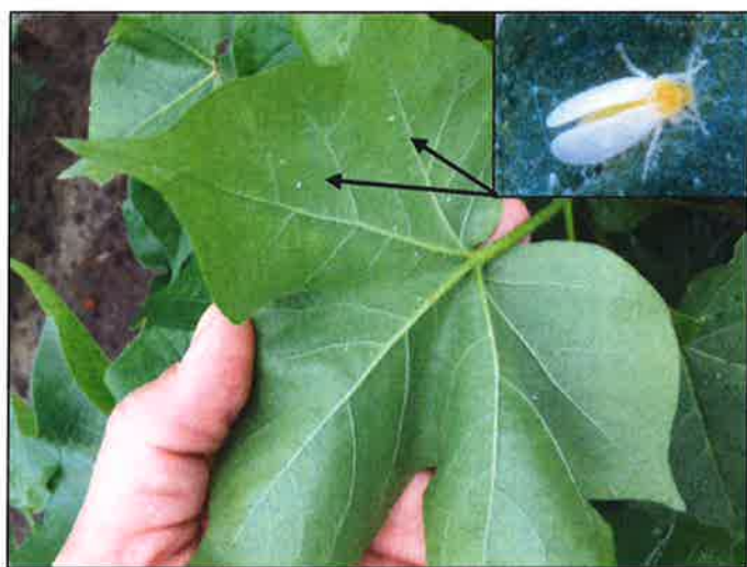
Adult SLWF Infestations: leaves are considered infested if 3 adult SLWFs are observed. After counting adults detach the leaf from the main stem.