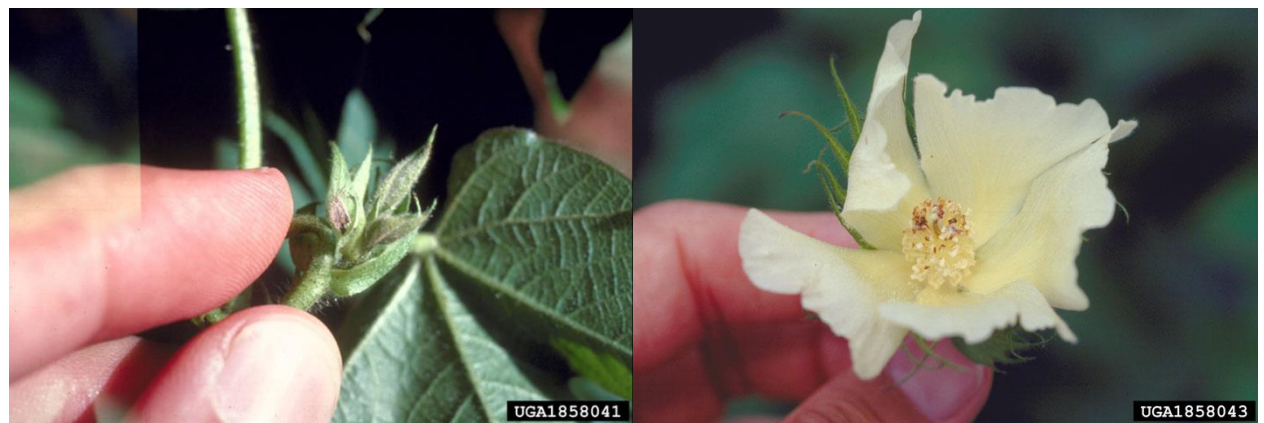
Square shedding due to tarnished plant bug feeding (left) and a dirty bloom resulting from tarnished plant bug feeding on a large square.

elliptical scar where the square was attached remains. No visible damage is apparent on the outer surface of squares damaged by plant bugs. Plant bug feeding in the terminal may alter the physiology and result in a malformed plant. Large squares which are damaged will often remain on the plant and appear healthy and normal, however when the square blooms the flower will have warty growths on the petals and darkened anthers. This type of flower damage is referred to as a "dirty bloom". Plant bugs may also feed on small bolls. Excessive feeding may cause boll shed, but most often localized lint and seed damage is the result. Callous warty growths on the inner surface of the boll wall will often form near the feeding site (appears very similar to stink bug damage).