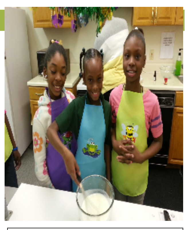
Fulton County 4-H'ers (left) mixing wet beignet recipe ingredients.

Fulton County Cooperative Extension youth development program held it's Fulton 4-H Kids in the Kitchen cooking club meeting for students interested in learning basics of maneuvering in the kitchen. Students participating in this club learn to follow recipes for making snacks and meals for themselves and their families.